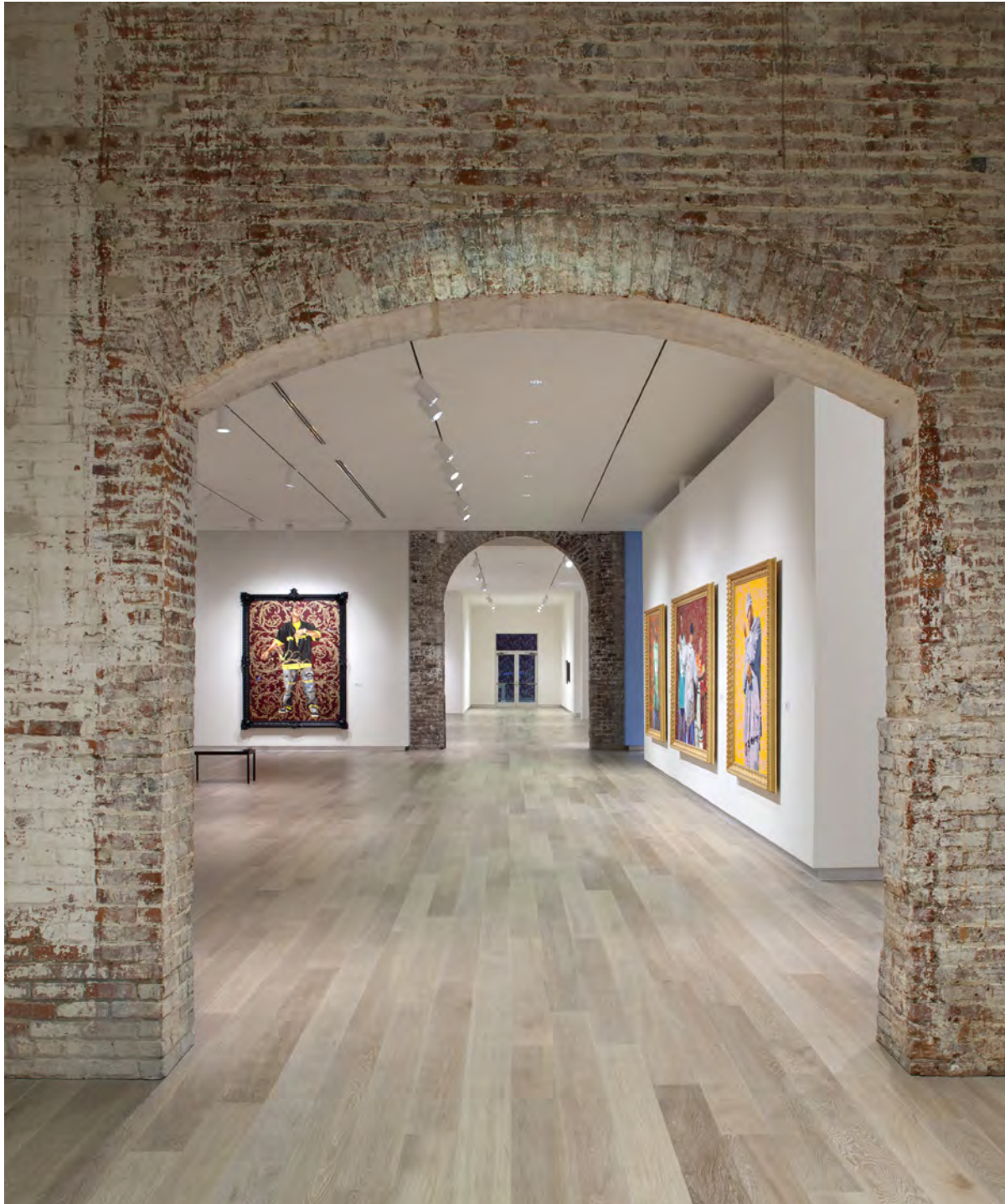
34 The museum brings together old and new, juxtaposing pristine contemporary spaces with historic remains.