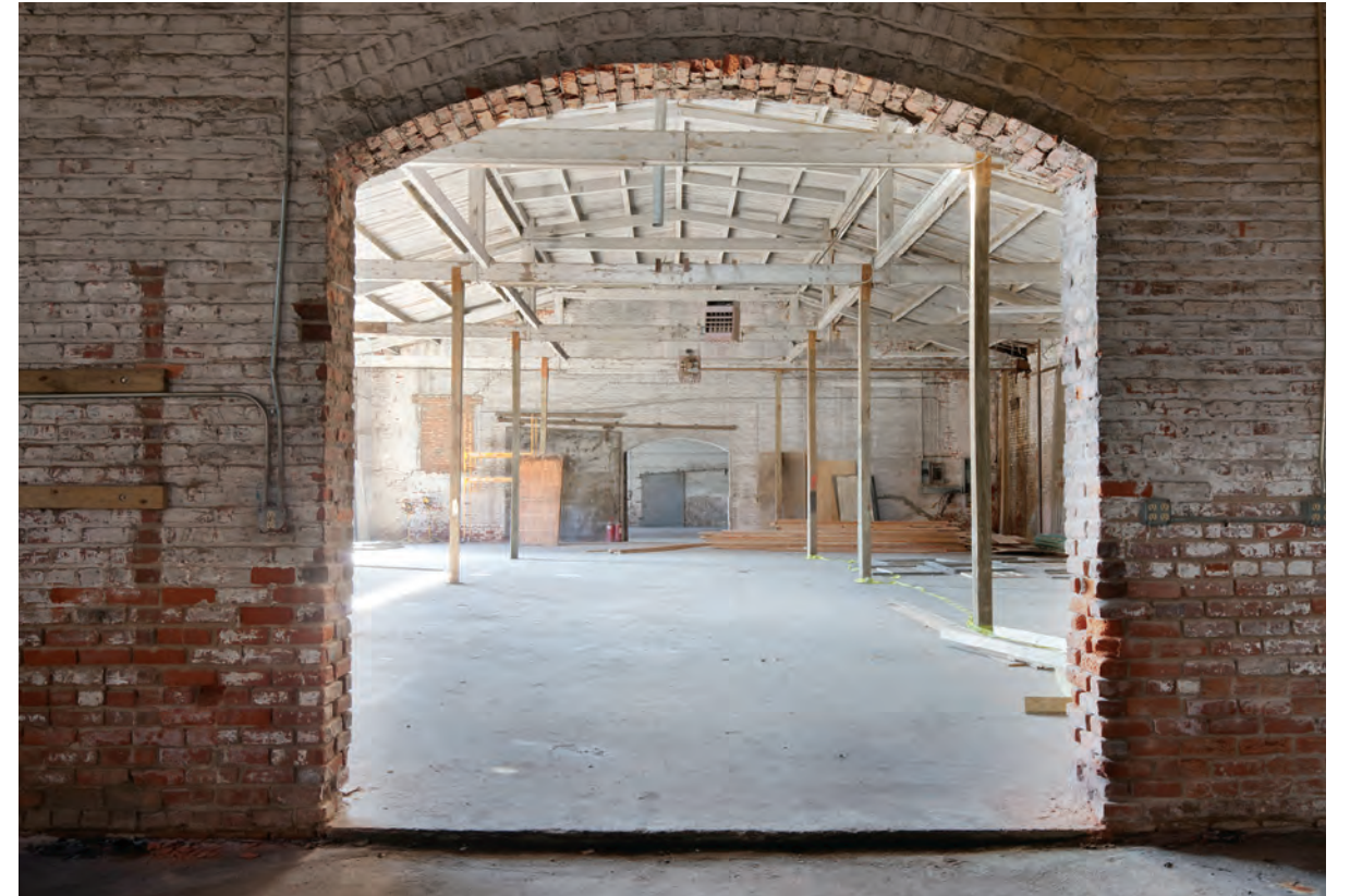
Interior view of the historic Central of Georgia Railroad depot before preservation.