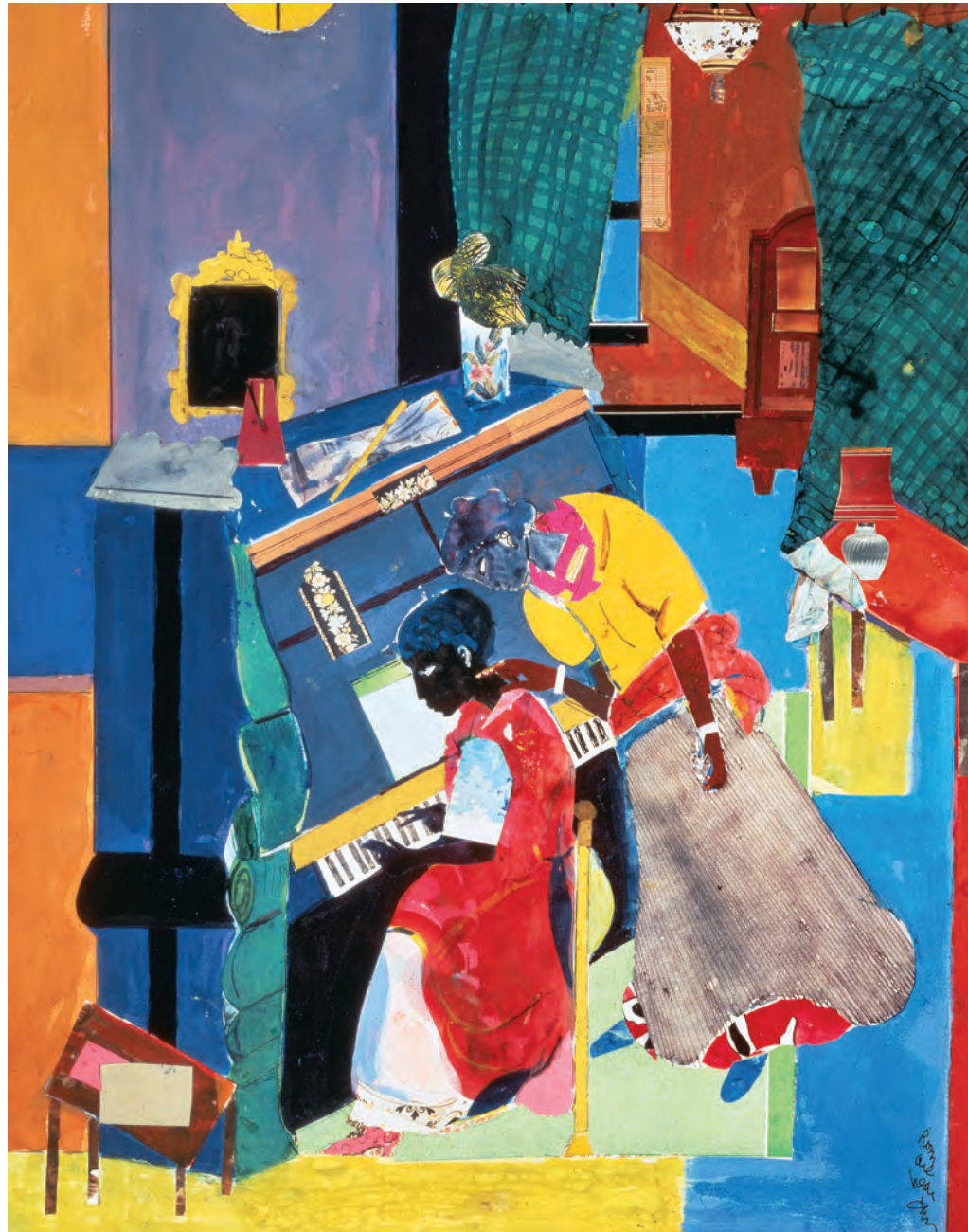
Romare Bearden, The Piano Lesson , collage on board, 29" x 22", 1983. SCAD Museum of Art, Walter O. Evans Collection of African American Art.