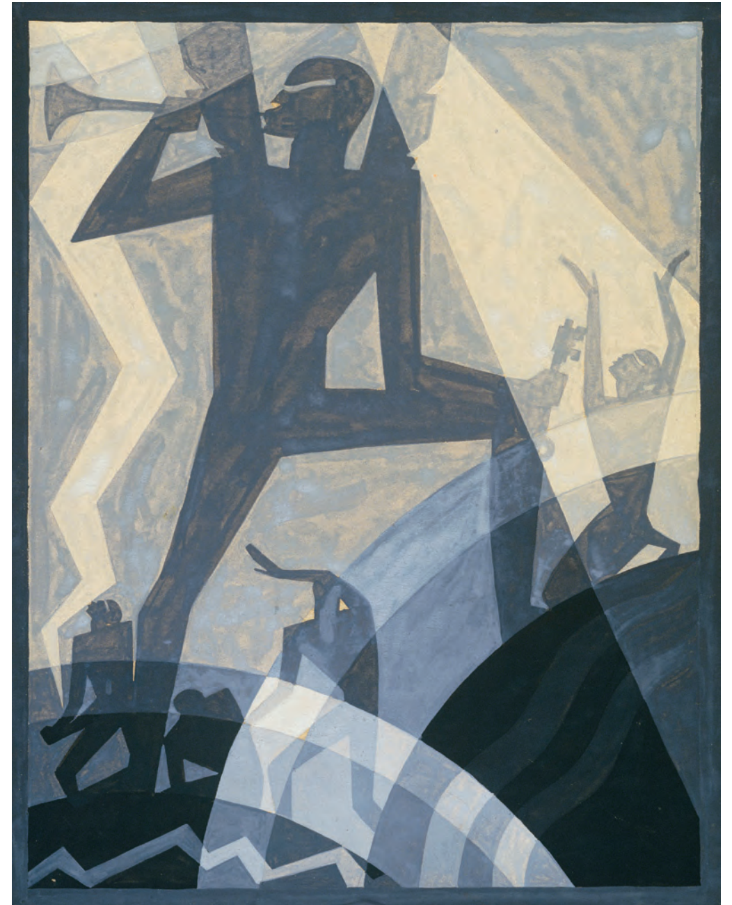
Aron Douglas, The Judgment Day , gouache on paper, 11.75" x 9", 1927. SCAD Museum of Art, Walter O. Evans Collection of African American Art.